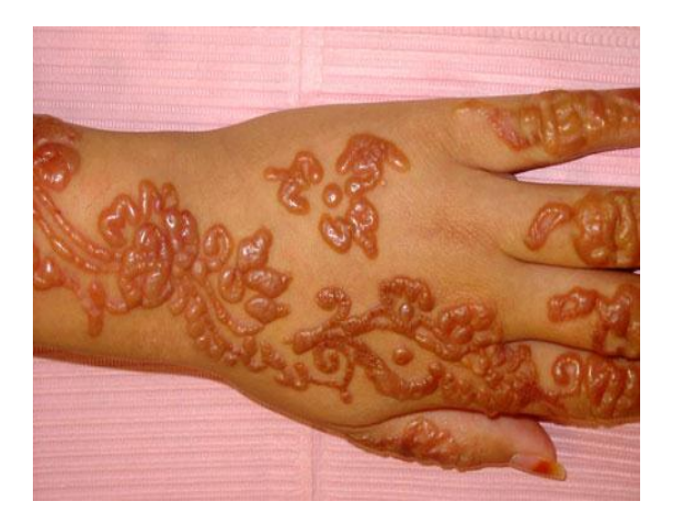
Skin Infection from Henna. Temporary tattoo inks can also contain toxins including bacteria

http://www.ibtimes.co.uk/articles/507961/2 0130922/tattoo-cancer-toxic-carcinogenictattoist-beckham.htm