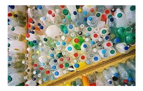
Phthalates are also found in many plastic products.

Black ink can also contain common platicisers. Dibutyl phthylate was found in 14 black tattoo inks in a recent survey. Phthalates have been linked to endocrine disruption where they mimic estrogen and disrupt testesterone. Pregnant and nursing women should particularly avoid tattooing as endocrine disruptors could impact on the foetus and be passed through to a baby via breast milk.