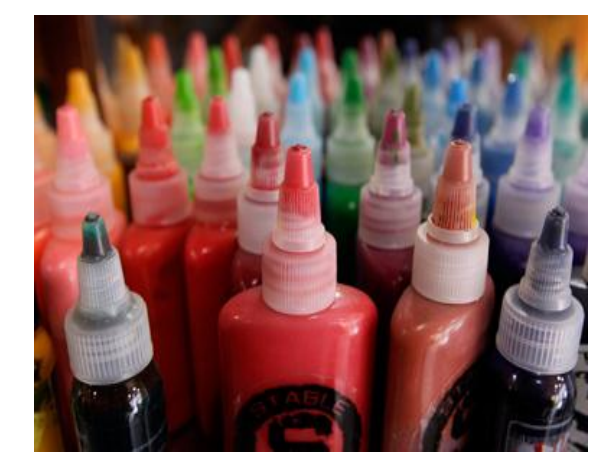
Image: <u>http://www.environmentalhealthnews.org/e</u> <u>hs/news/2011/tattoo-inks-face-scrutiny</u>